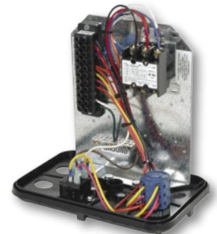
NIL Last Tower Box 22058

NIL controls & parts can be used as direct replacements for Lindsay style boxes.