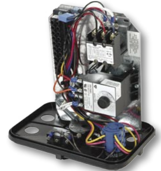
NIL Stall Timer Tower Box 22057