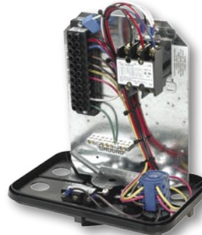
NIL Intermediate Tower Box 22056