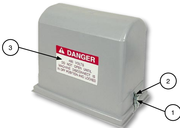
Control Box Cover, complete with latches 90607