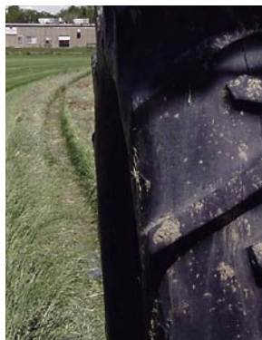
Pivot track with Track Sack.