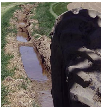
Pivot track without Track Sack.