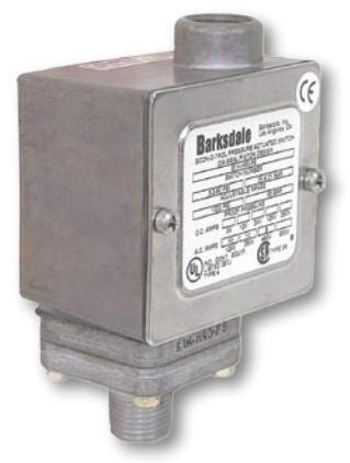
93609 or 936200